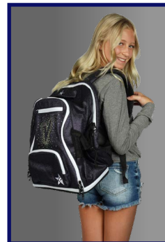
CheerVille Rebel Navy Dream Bag (optional)